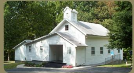
Morrisetts Chapel Baptist Church

Several churches in the Holston Valley Baptist Association have been recently recognized by the Tennessee Baptist Mission Board. A list was published by the TBMB naming the top 100 churches that gave to the Cooperative Program based on a percentage of their total giving. Morrisetts Chapel Baptist Church in Whitesburg ranked 1st in the state by giving 31.84% of their total giving to the Cooperative Program. Hickory Cove Baptist Church in Rogersville ranked 15th by giving 16.08%. Tunnell Hill Baptist Church in Rogersville ranked 17th in Tennessee by giving 15.67%. Henards Chapel Baptist Church in Rogersville gave 14.59% of their total giving to the Cooperative Program which placed them 30th in the state. These churches and their members are to be applauded for their generosity! Through the Cooperative Program, The Tennessee Baptist Mission Board distributes funds to Baptist schools and universities, the Tennessee Adult and Children's Homes, and the Tennessee Baptist Foundation.