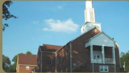
Henards Chapel Baptist Church