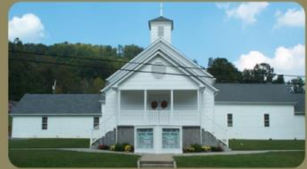
Hickory Cove Baptist Church