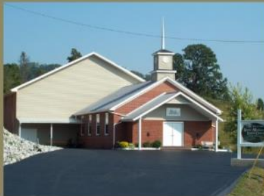
Keplar Baptist Church