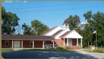
Tunnell Hill Baptist Church