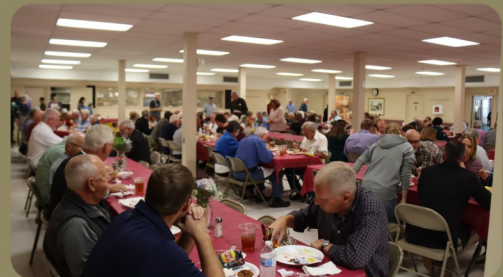
Church Hill First Baptist Church provided everyone with a delicious meal.