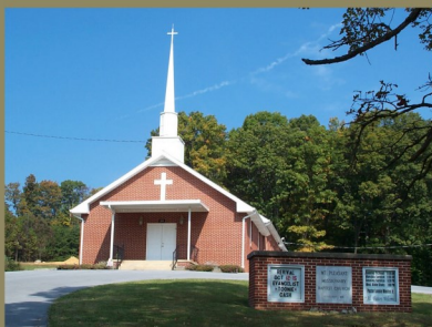
Mount Pleasant Baptist Church