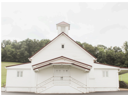
Valley View Baptist Church Rev. Neal Lane