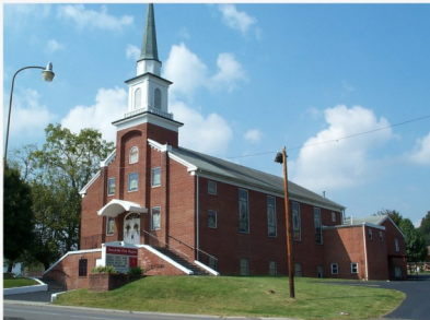
Sneedville First Baptist Church